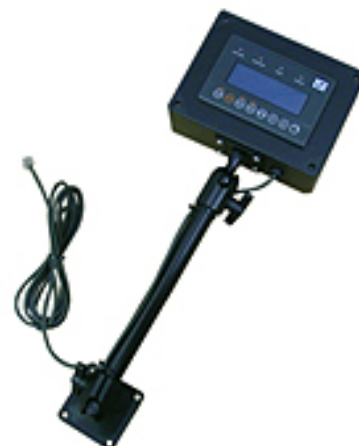
Remote Display Mounting Kit