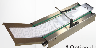
* Optional stacker shown, sold separately.

When used together with a Windows® based design application like MS Word®, Adobe®, or others, the Tagmaster 1006n can act as a complete "design, print and cut" system.